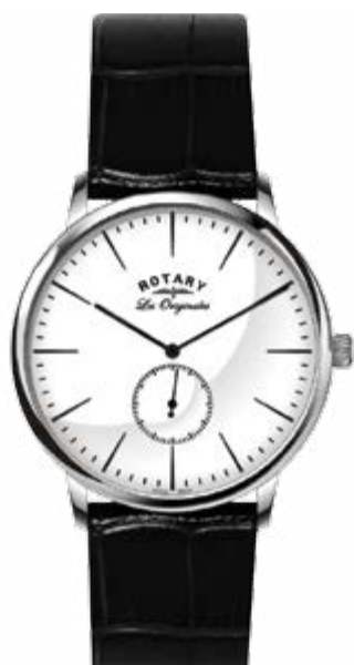
GS90050/02 Ø 38 mm