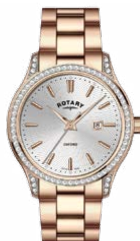
LB05096/02 Ø 32 mm