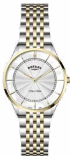
LB08301/41 Ø 27 mm