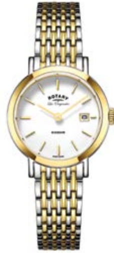
LB90154/01 Ø 27 mm