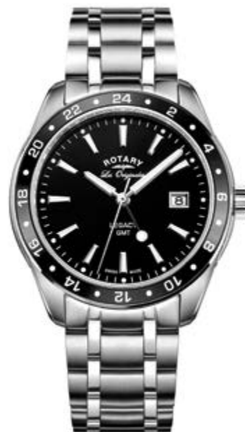
GB90172/04 Ø 41.5 mm GMT