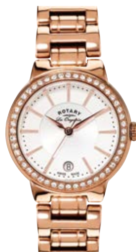
LB90085/02L Ø 34 mm