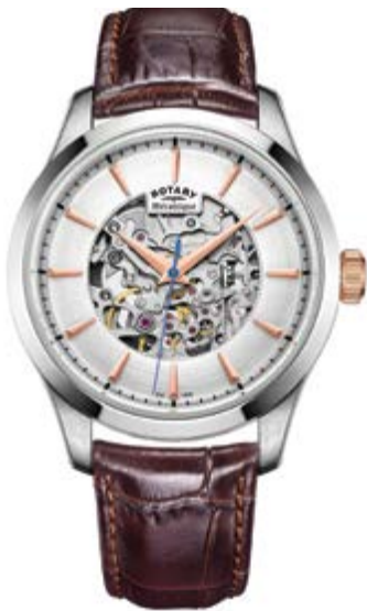
GS05032/06 Ø 40 mm