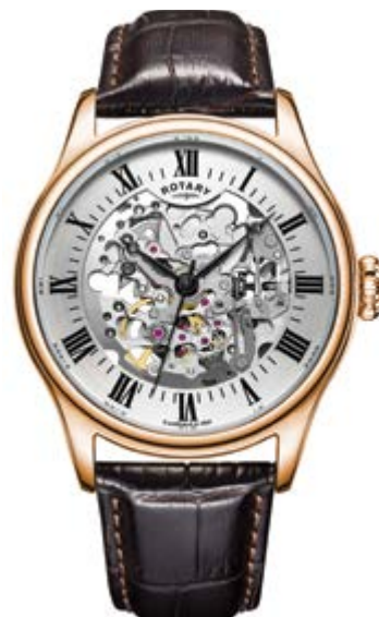
GS02942/01 Ø 40 mm