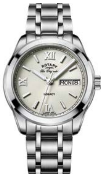
GB90173/06 Ø 38 mm