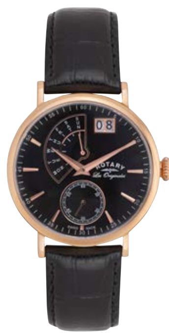
GS90087/04 Ø 41.5 mm