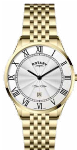
GB08303/01 Ø 38 mm