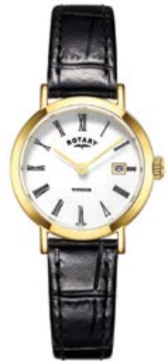
LS05303/01 Ø 27 mm