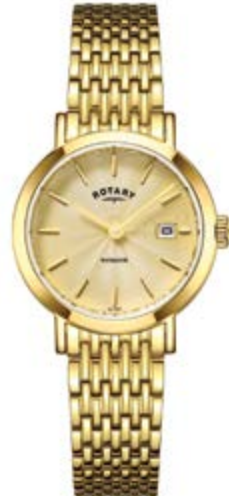
LB05303/03 Ø 27 mm