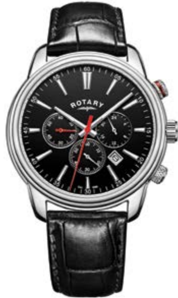
GS05083/04 Ø 42 mm