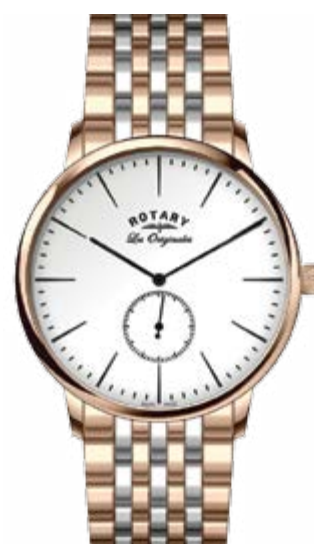
GB90057/06 Ø 38 mm