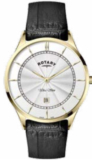
GS08303/02 Ø 38 mm