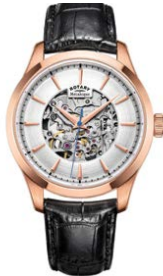
GS05036/06 Ø 40 mm