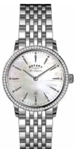
LB90050/41 Ø 29 mm