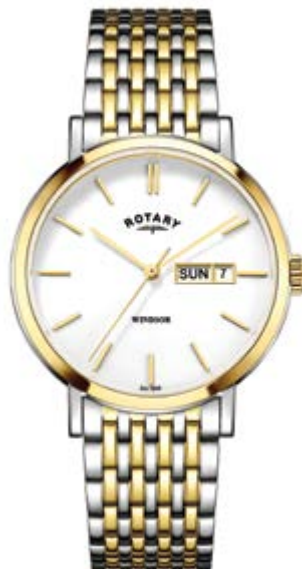
GB05301/01 Ø 37 mm