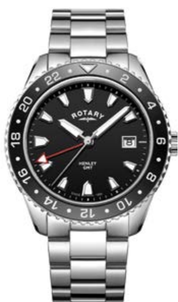
GB05108/04 Ø 41.5 mm GMT