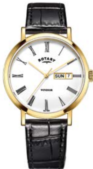
GS05303/01 Ø 37 mm