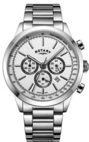
GB05253/02 Ø 42 mm