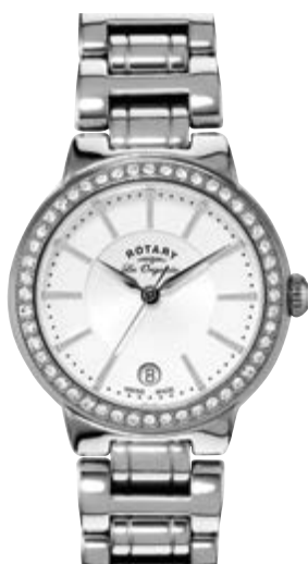
LB90081/02L Ø 34 mm