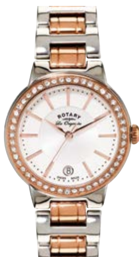
LB90083/02L Ø 34 mm