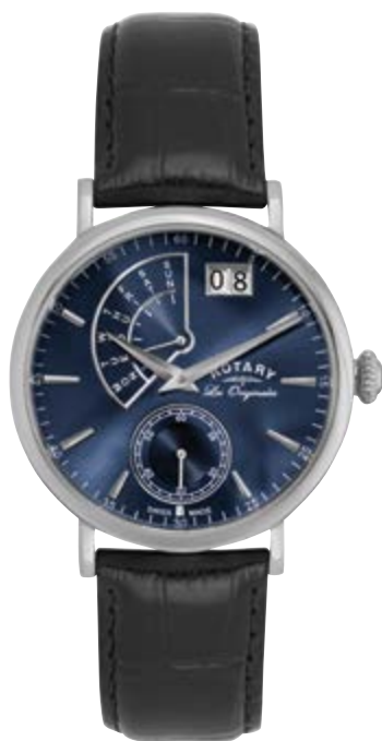
GS90085/05 Ø 41.5 mm