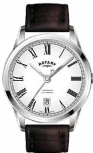
GS05250/01 Ø 40.5 mm Automatic