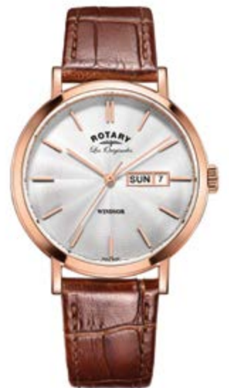
GS90157/02 Ø 37 mm