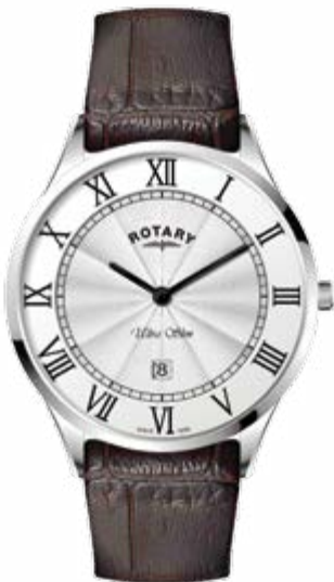
GS08300/01 Ø 38 mm