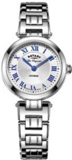
LB90186/01 Ø 28mm