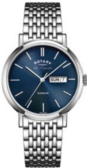
GB90153/05 Ø 37 mm