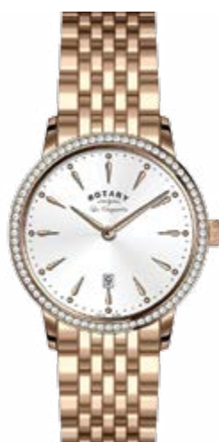
LB90054/06 Ø 29 mm