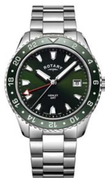
GB05108/24 Ø 41.5 mm GMT