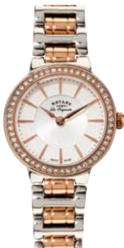
LB90083/02 Ø 30 mm