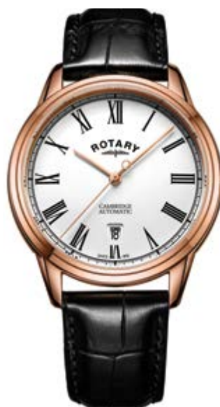
GS05252/01 Ø 40.5 mm Automatic