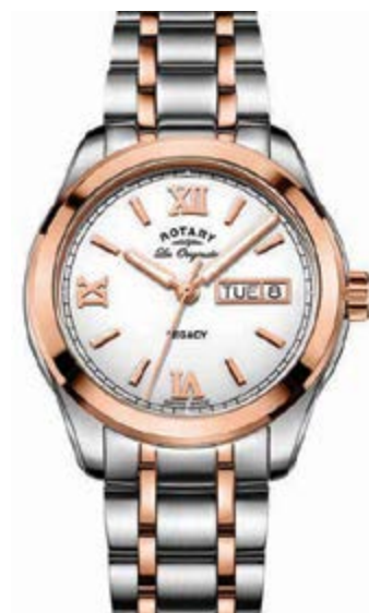
GB90175/06 Ø 38 mm