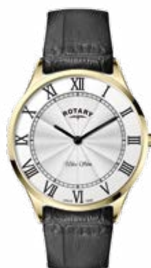
LS08303/01 Ø 27 mm