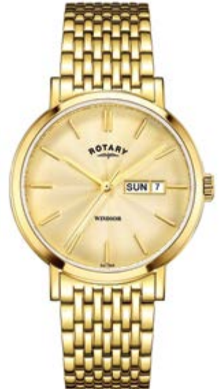
GB05303/03 Ø 37 mm