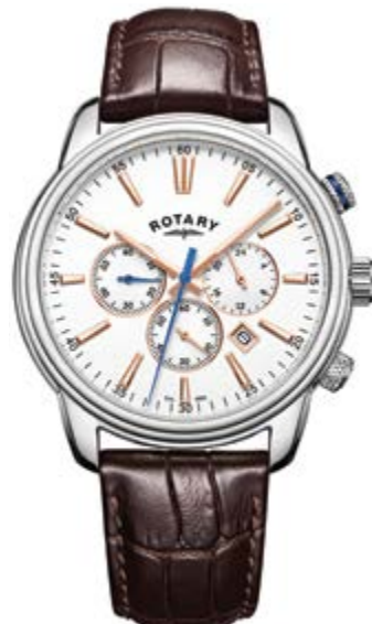
GS05083/06 Ø 42 mm