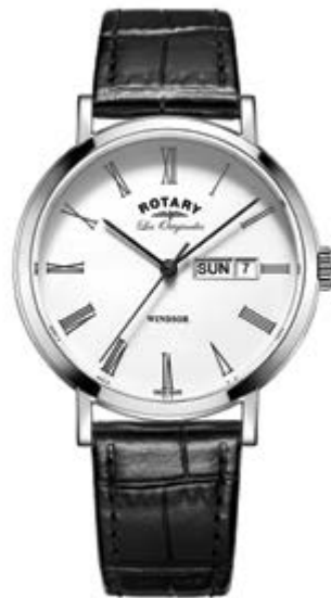
GS90153/01 Ø 37 mm