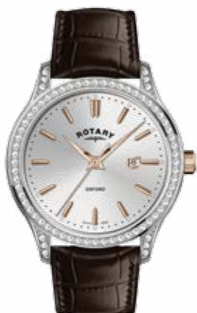
LS05092/02 Ø 32 mm