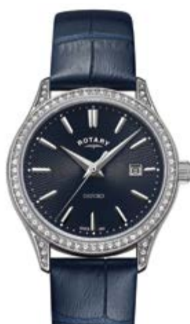
LS05092/05 Ø 32 mm