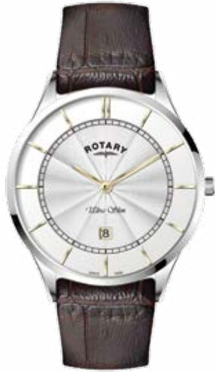
GS08300/02 Ø 38 mm