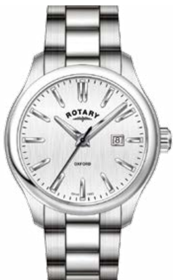
GB05092/02 Ø 40.5 mm