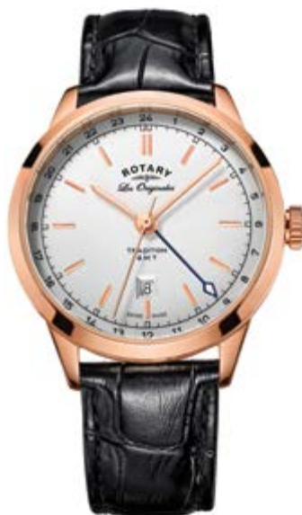
GS90183/02 Ø 40 mm GMT