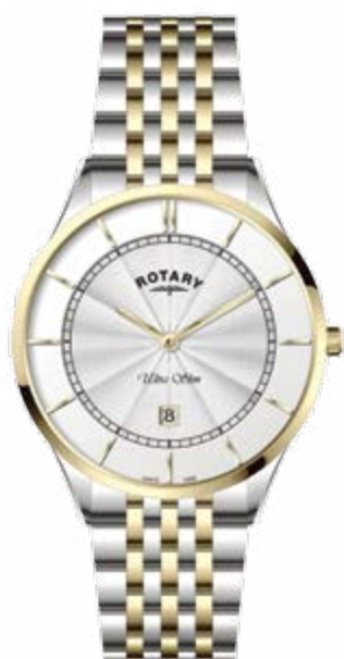
GB08301/02 Ø 38 mm