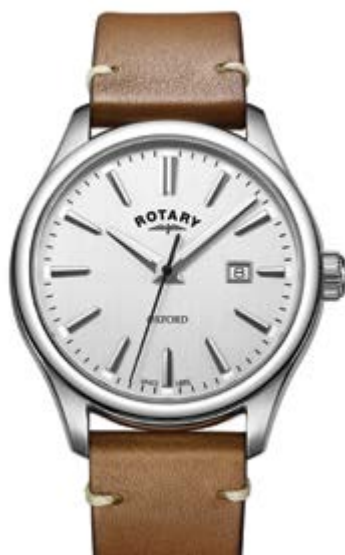
GS05092/02 Ø 40.5 mm