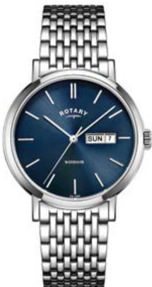
GB05300/05 Ø 37 mm