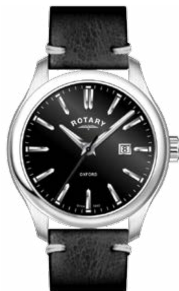
GS05092/04 Ø 40.5 mm