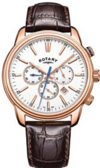
GS05084/06 Ø 42 mm