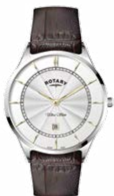
LS08300/02 Ø 27 mm