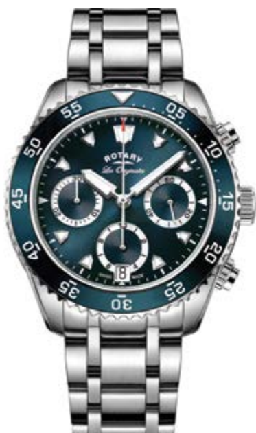
GB90170/05 Ø 43 mm