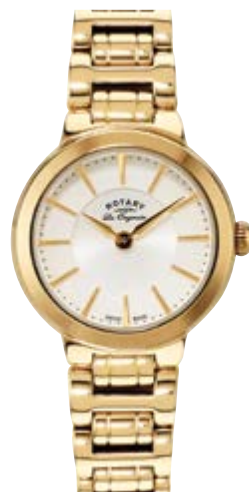
LB90084/02 Ø 30 mm