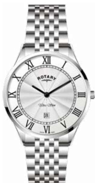
GB08300/01 Ø 38 mm