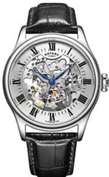
GS02940/06 Ø 40 mm