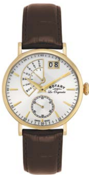
GS90086/06 Ø 41.5 mm