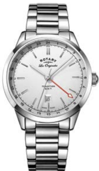
GB90181/02 Ø 40 mm GMT