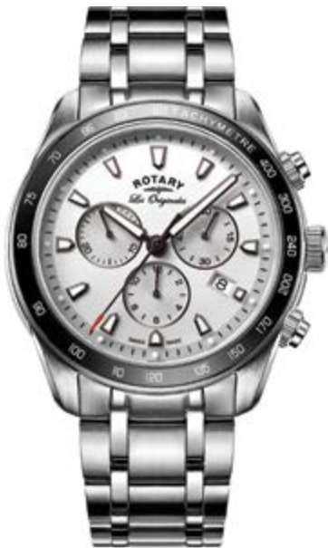
GB90169/02 Ø 43 mm