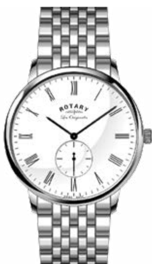
GB90050/01 Ø 38 mm