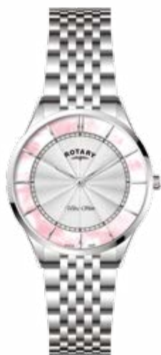
LB08300/07 Ø 27 mm