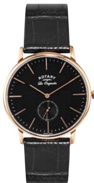
GS90053/04 Ø 38 mm