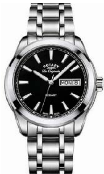
GB90173/04 Ø 38 mm