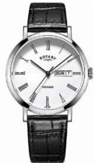
GS05300/01 Ø 37 mm