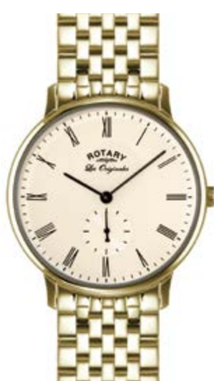
GB90052/01 Ø 38 mm