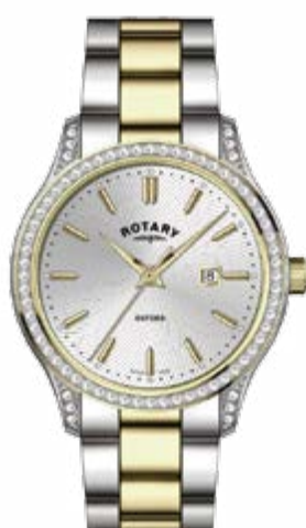
LB05093/02 Ø 32 mm