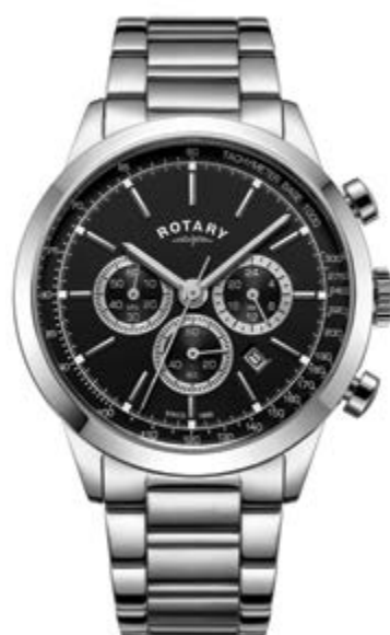
GB05253/04 Ø 42 mm