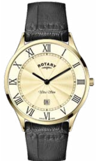
GS08303/03 Ø 38 mm