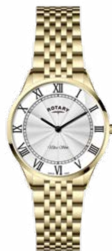
LB08303/01 Ø 27 mm