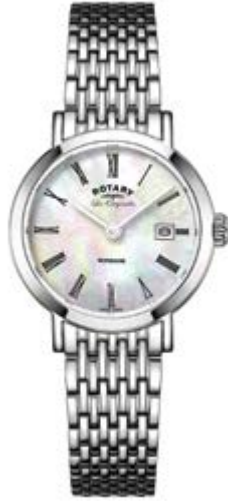
LB90153/07 Ø 27 mm