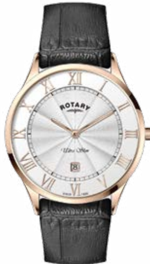
GS08304/01 Ø 38 mm