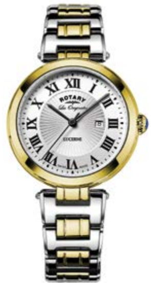
LB90188/01/L Ø 34 mm