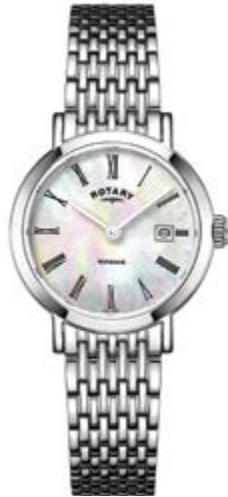
LB05300/07 Ø 27 mm