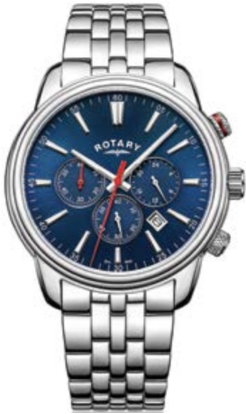
GB05083/05 Ø 42 mm