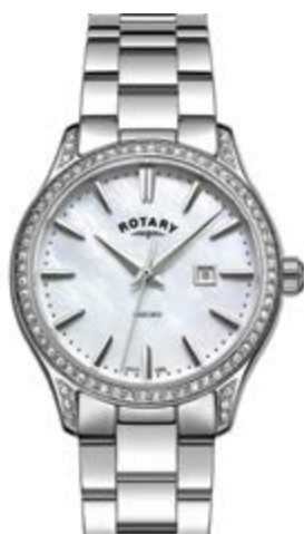
LB05092/41 Ø 32 mm