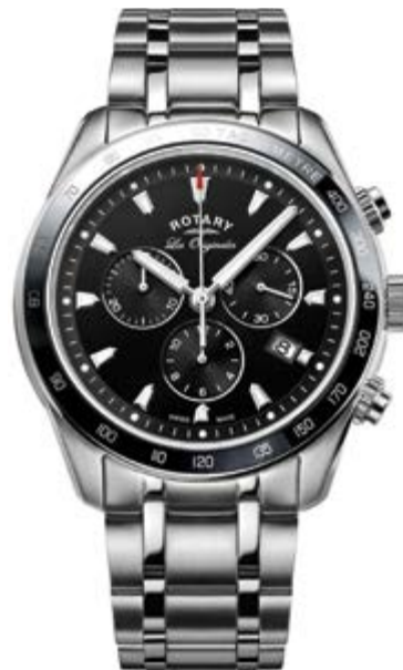
GB90169/04 Ø 43 mm