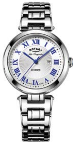
LB90186/01/L Ø 34 mm